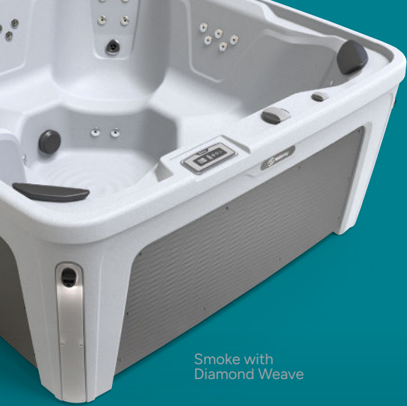
Smoke with Diamond Weave