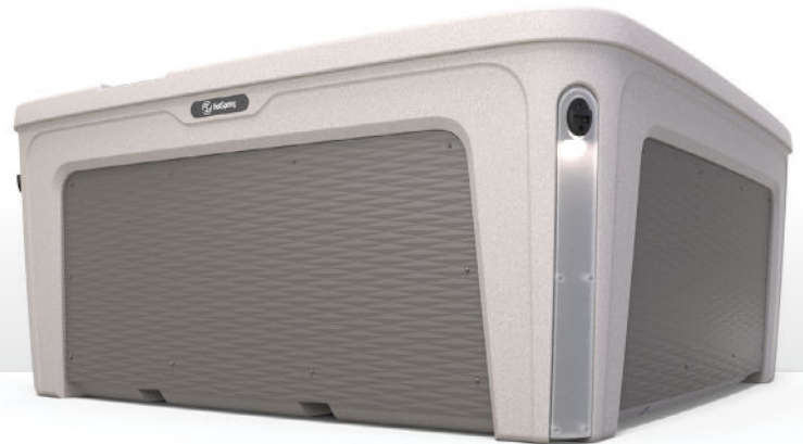
Dune with Diamond Weave