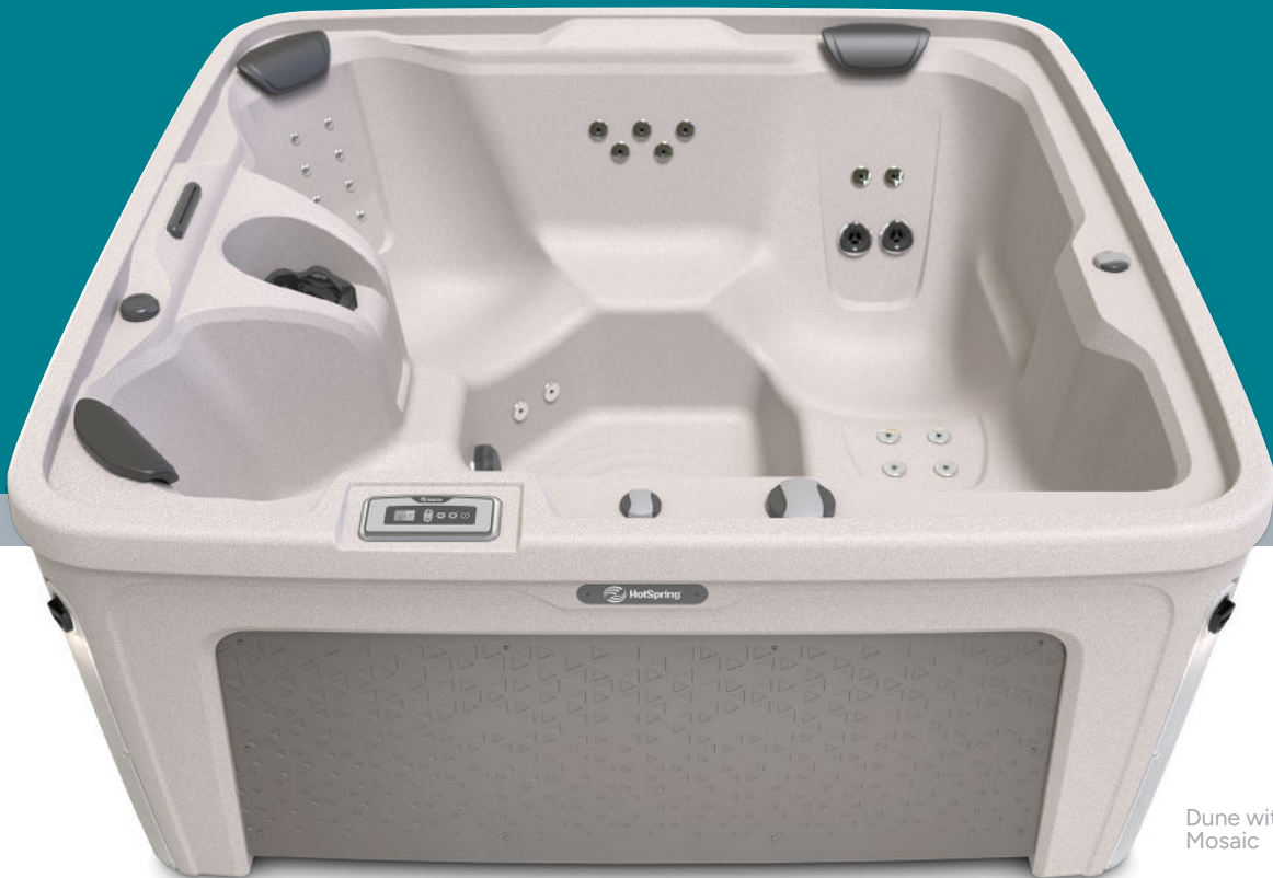
Dune with Mosaic